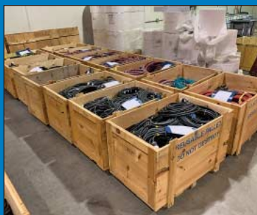
(9) Crates - Electrical Wire Including 20 Amp / 480 Volt / 3-Phase, 20 Amp / 125 Volt / 20 Amp / 250 Volt