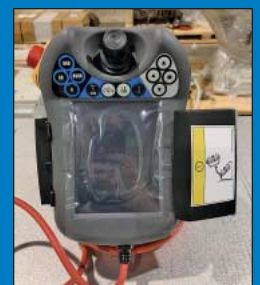
(6) ABB IRB 6700-150/3.20 Six-Axis Track Mounted Robots