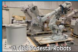
(7) ABB Pedestal Robots

Contact Information 2020 Dunlap St. Cincinnati, Ohio 45214 Phone 513-241-9701 Fax 513-241-6760 www.cia-auction.com