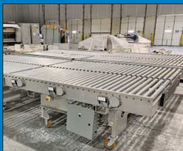
(14) 84" X 90" L Portable Universal Power Roller Conveyor