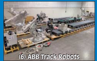
(6) ABB Track Robots