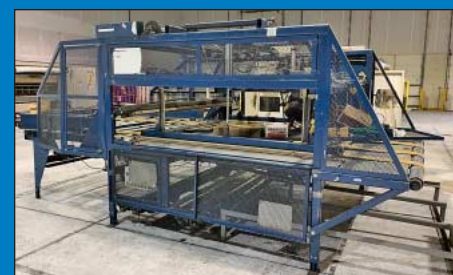
84" W WBSCO Poly Wrapper U-Seal Mattress Bagger