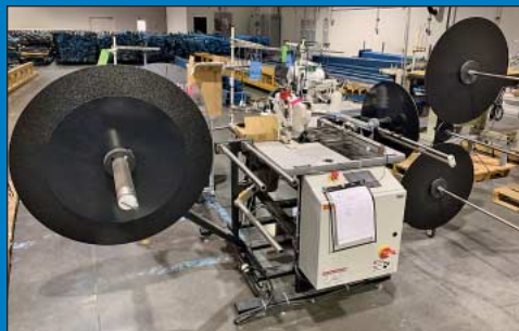
Porter Model BMS-1500 Sewing Machine, with PLC