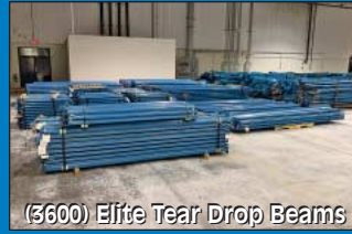
(3600) Elite Tear Drop Beams