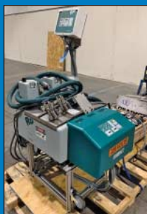
Robatech Model Concept Hot Melt Gluing System with AS50/4 Pattern Control