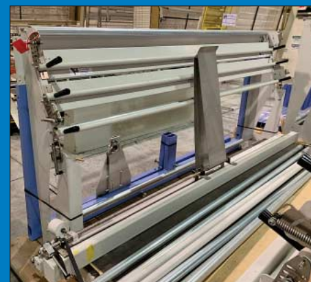
(37) 112" Wide Mammut Material