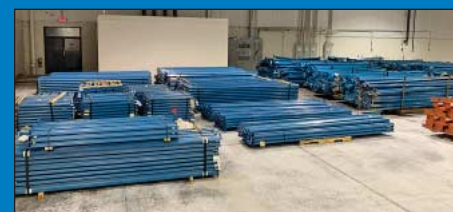
(1,200) 120" Long X 4" Face Tear Drop Style Pallet Rack Step Beams