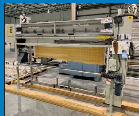
90" Global Systems Group Border Slitter