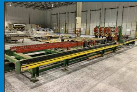
60" Wide Viking Model Skute Foundation Nailer