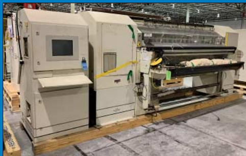
90" Gribetz International Model GI-4300e Plus Quilter