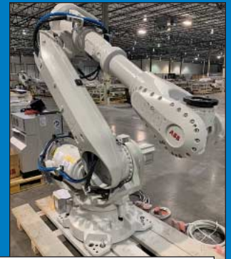
(7) ABB IRB 6700-150/3.20 Six-Axis Pedestal Type Robots